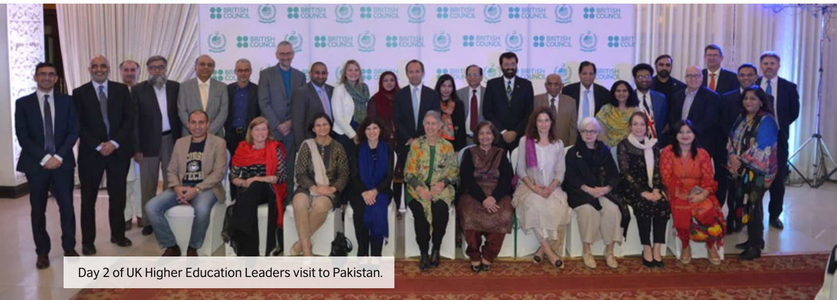
Day 2 of UK Higher Education Leaders visit to Pakistan.

After the success of the roadshows in the UK, the British Council and Higher Education Commission of Pakistan invited a group of the UK Higher Education Senior Leaders to visit Pakistan between 25-29 November 2018.