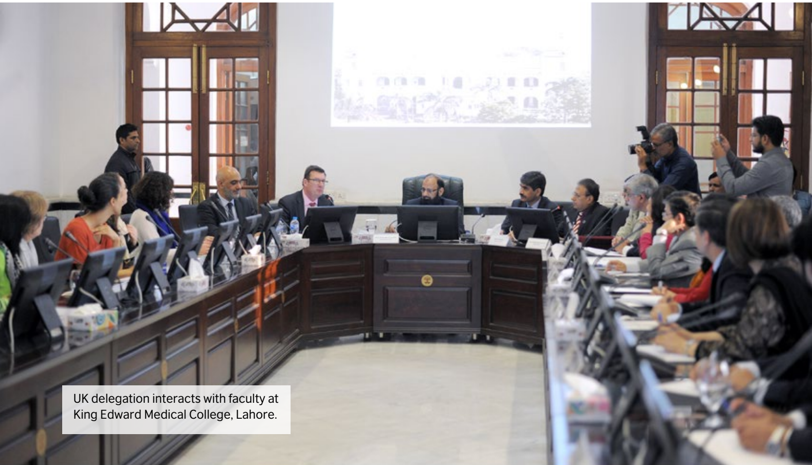
UK delegation interacts with faculty at King Edward Medical College, Lahore.