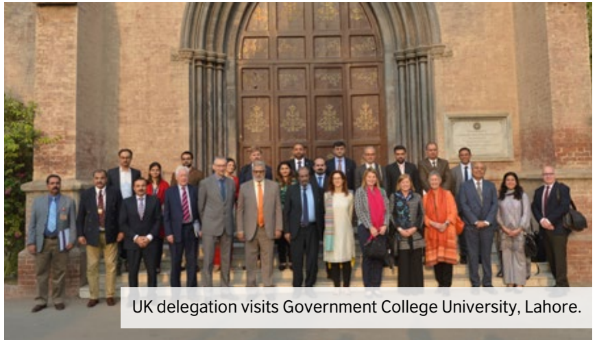
UK delegation visits Government College University, Lahore.