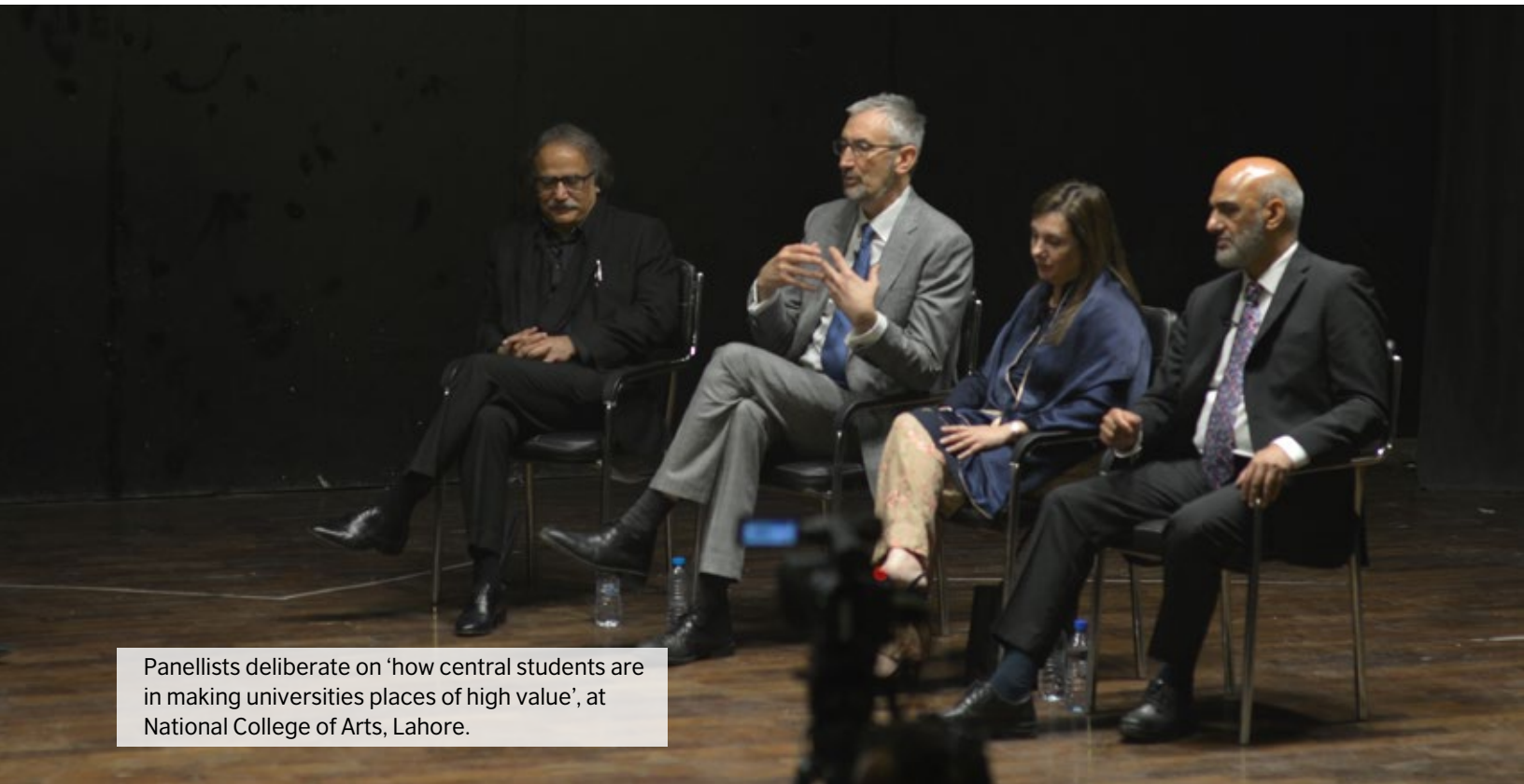
Panellists deliberate on 'how central students are in making universities places of high value', at National College of Arts, Lahore.