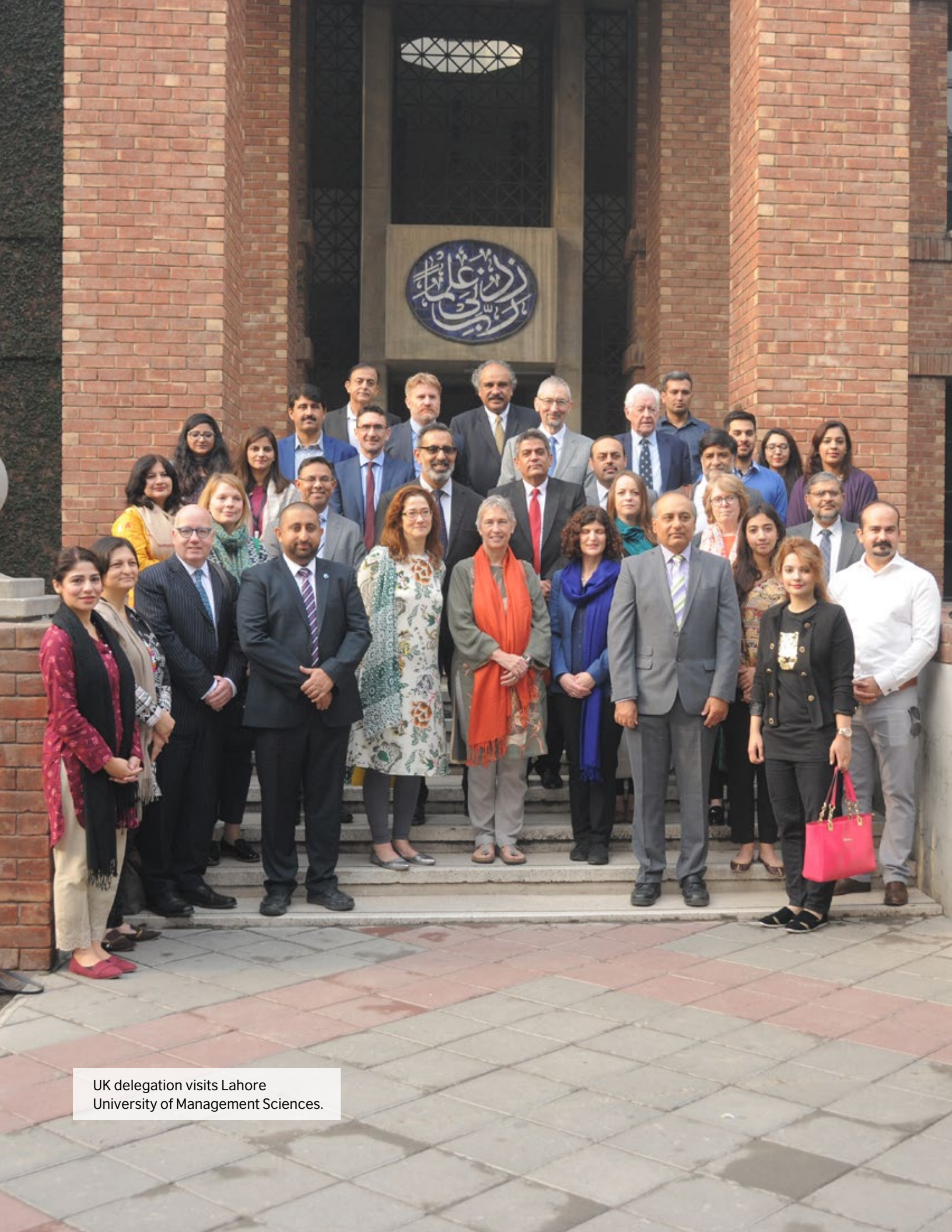
UK delegation visits Lahore University of Management Sciences.