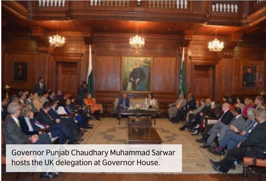
Governor Punjab Chaudhary Muhammad Sarwar hosts the UK delegation at Governor House.

According to UNESCO statistics, in the last 5 years, UK has been the 2nd destination for Pakistani students to pursue their education.